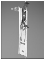
Drop Wire Bracket