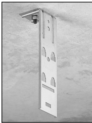
Ceiling Mount Bracket