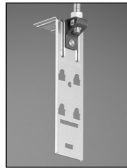
Threaded Rod Bracket