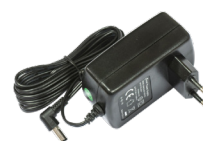
24 V 1.2 A power adapter included

IPsec hardware encryption (~470 Mbps) and The Dude server package are both supported, and the microSD slot provides improved read/write speed for file storage.