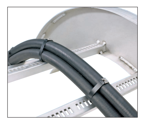
Application Electrical cabling secured to cable tray in harsh environments