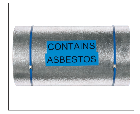
Application Secure metal shield over pipe insulation