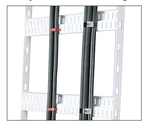
Application Fire protection cabling secured to a cable tray