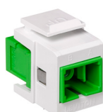
QuickPort SC/APC Adapter