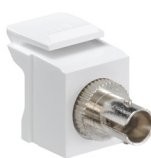
QuickPort ST Adapter