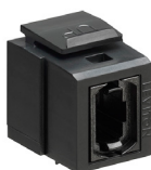
QuickPort MTP Adapter