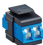
QuickPort LC Shuttered Adapter