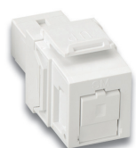
QuickPort SC Shuttered Adapter

QuickPort Fiber Optic Adapters provide connectivity for workstation cabling termination on single-mode and multimode fiber cable. QuickPort bulkhead modules snap into any housing with the QuickPort name: flush- and surface-mount outlets, Multimedia Outlet System (with adapter), patch panels, and patch blocks.