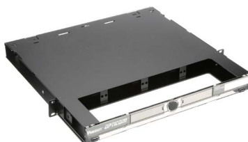
Opticom® Rack Mount Fiber Enclosures