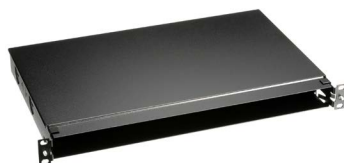
Opticom® Rack Mount Fiber Trays