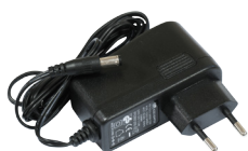
24V 0.38A Power adapter